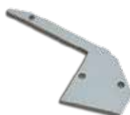
LEST 54 AS